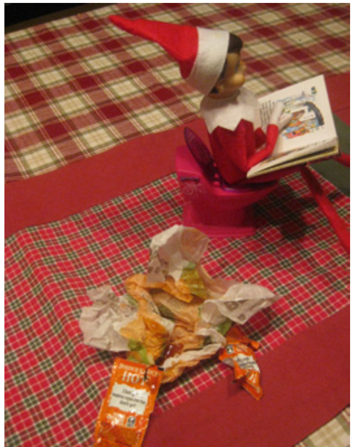
Our visitor from the North Pole ("M&M Pickley") can't handle south of the border cuisine. - Jennifer