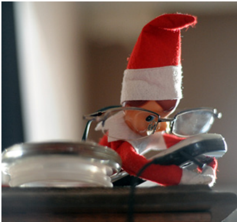
I apologize for any texts that were sent between 11 and 6. ;) - Dana