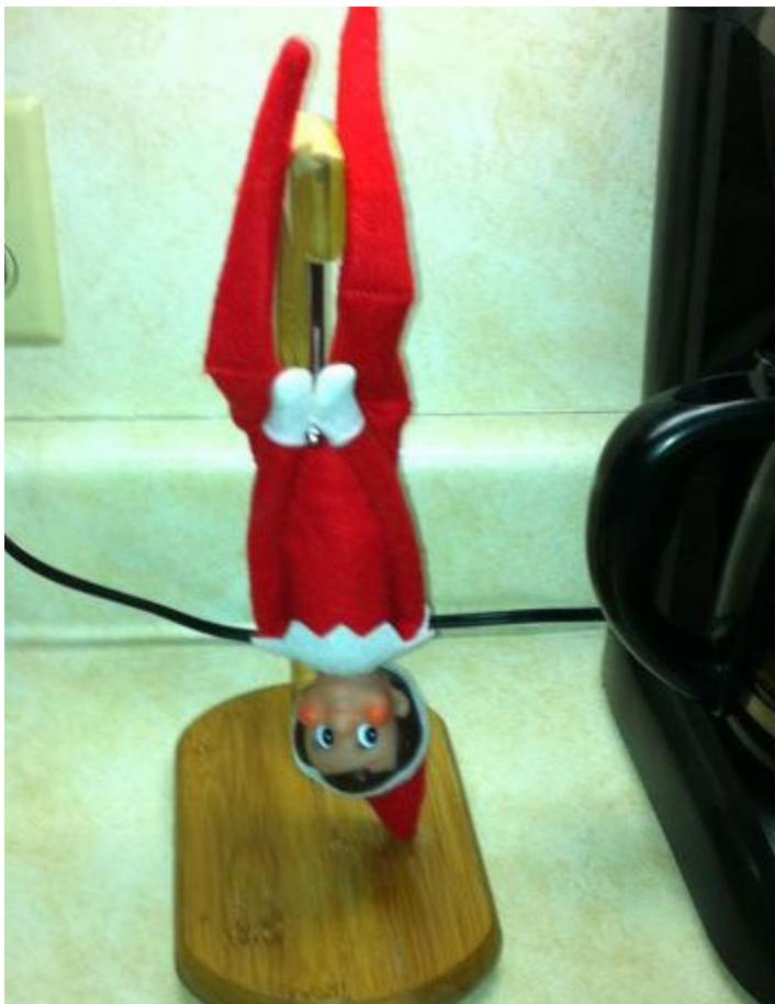
Our Elf's name is scout and he is full of holiday she-nanigans... Like reminding us to pick up bananas by behaving like a monkey! - Heather