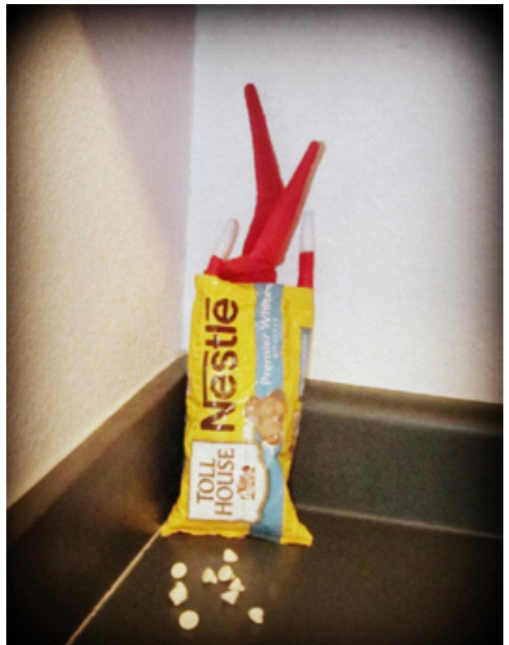
Here is what Eddie, our Elf on the Shelf, has been up to in the past week! - Beth