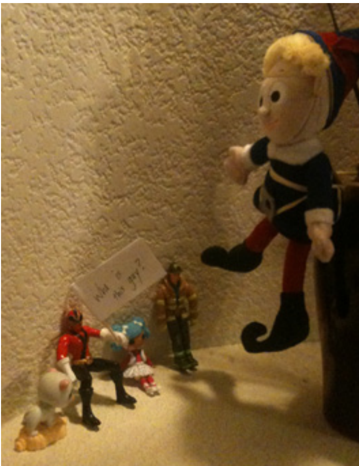
Our elf was held hostage for trespassing last night.